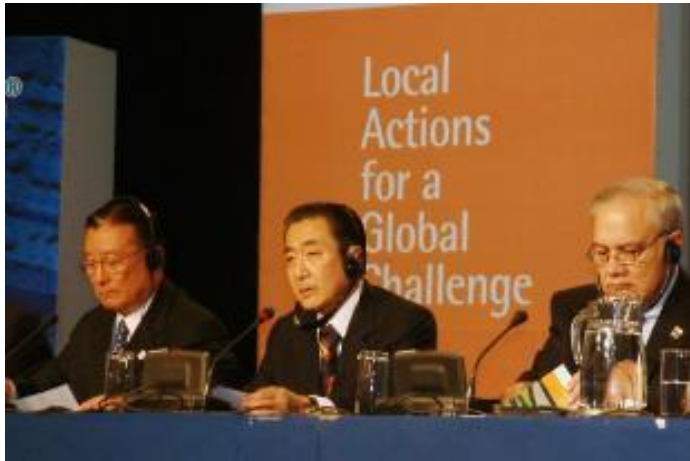
H.E. Ryutaro Hashimoto, Former Prime Minister of Japan, declared the establishment of the APWF (March 2006, 4 th World Water Forum (Mexico))