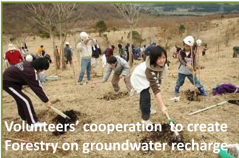
Volunteers' cooperation to create Forestry on groundwater recharge