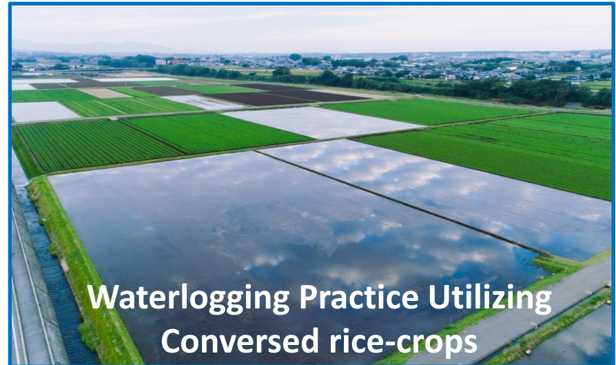
Waterlogging Practice Utilizing Converted rice-crops