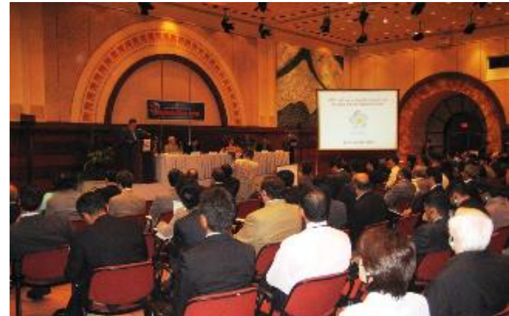
APWF Inauguration Ceremony (September 2006, ADB HQ (Manila))