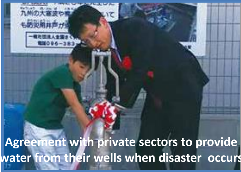
Agreement with private sectors to provide water from their wells when disaster occurs