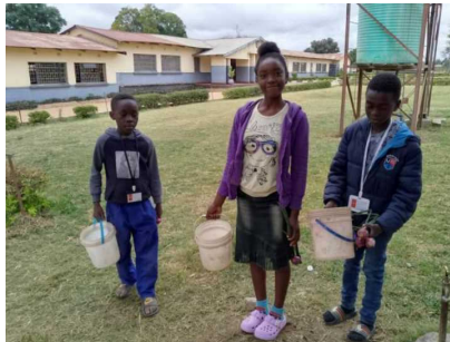
Pupils showing up to water the garden, but no water

Despite having a mechanized borehole system, the school faces persistent water shortages. Frequent power outages by electricity supplier ZESCO significantly limits the ability to pump and store water, resulting in empty tanks and inadequate water supply. The water scarcity leaves toilets without water and creates an unhygienic environment. The orchard and garden that provide the school's nutrition and environmental education are threatened. CYIC recently donated a fourth water tank to boost storage capacity, but the lack of consistent water pumping due to power outages remains unresolved.