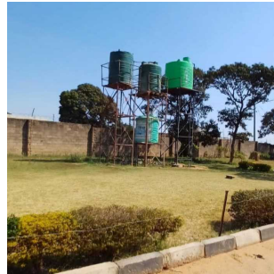
Water storage tanks supplied by an electric submersible pump