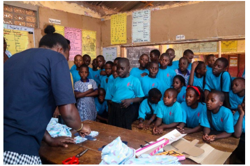
Demonstration on how to make sanitary pads