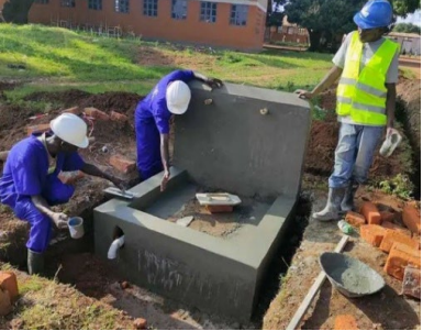
Hand washing facility construction