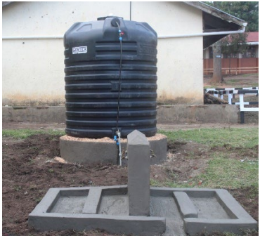
Water tank fully installed