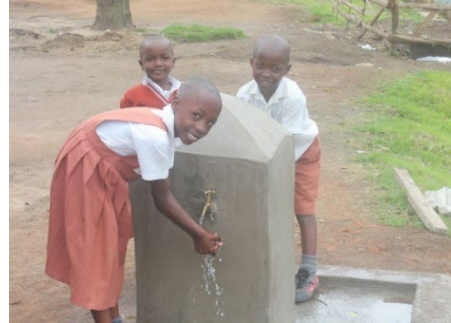
Students washing hands at the tap stands