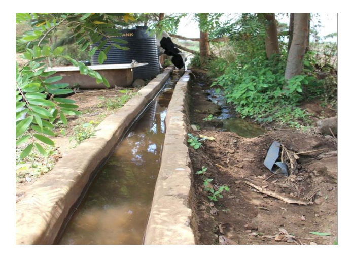
A canal running through the school premises