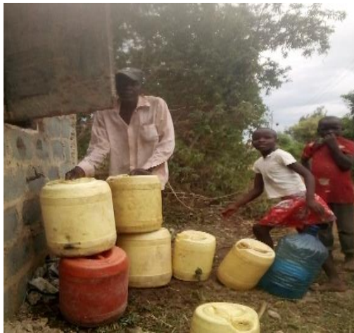
Supplying water at the kiosk