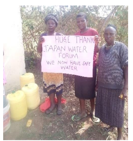
Women expressing their thanks in front of the water kiosk