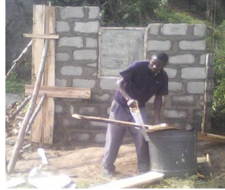
Installation of a water kiosk