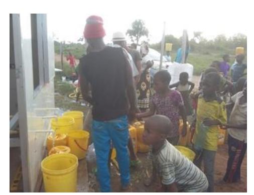
Community people fetching water from the water kiosk