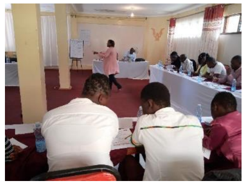
Training of 20 WASH promoters