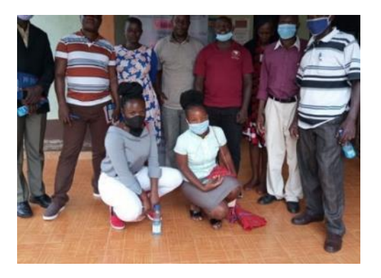
Meeting with stakeholders