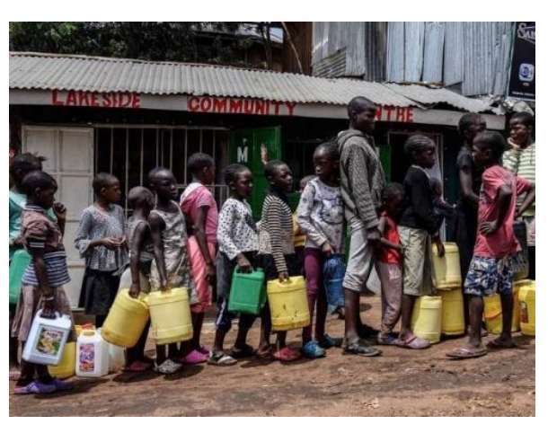
Children queuing up at a water point