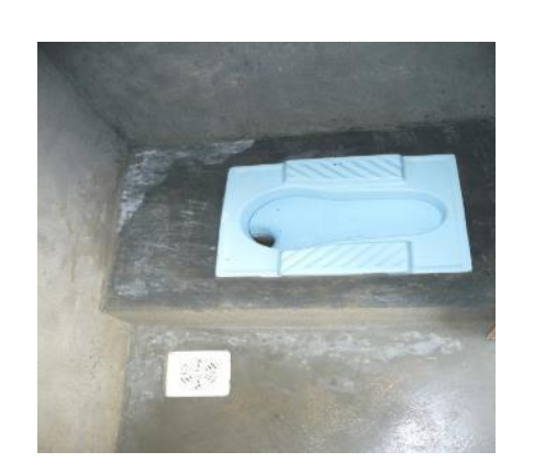
Inside of the VIP Toilet