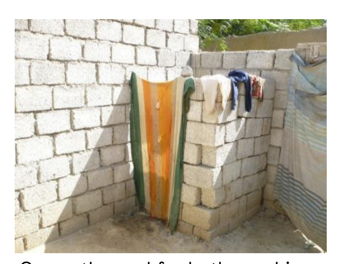
Currently used for both, washing and toilets