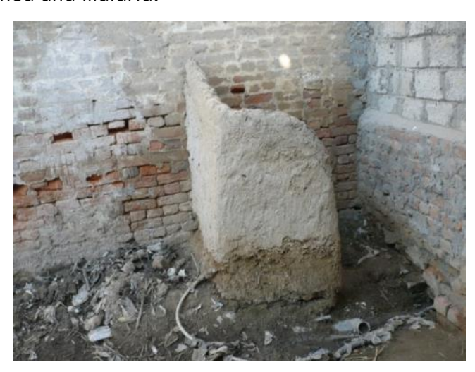
Peoples using the space as toilet pits currently