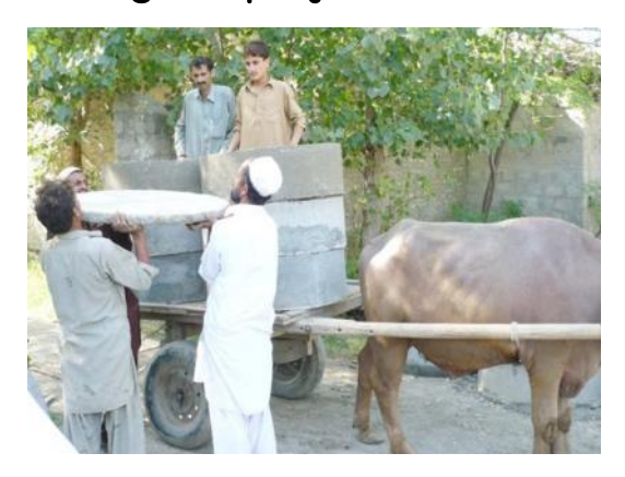
Transportation of the materials