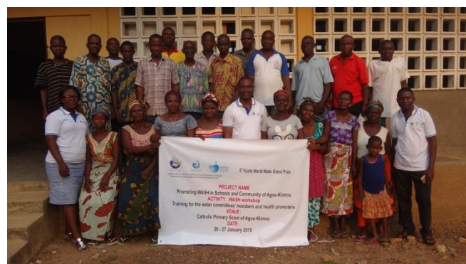
Water Committees' members and health promoters