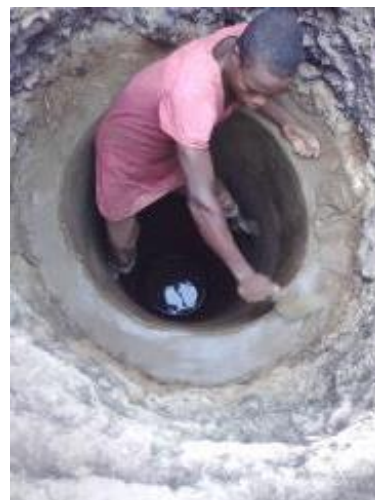
Construction of the well