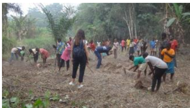
Students in their school garden