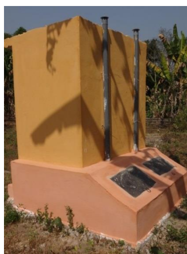
Constructed Eco-san toilets