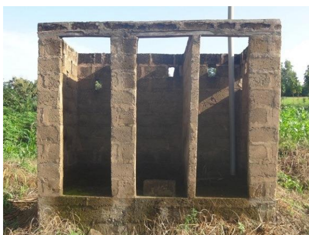
Existed VIP latrine