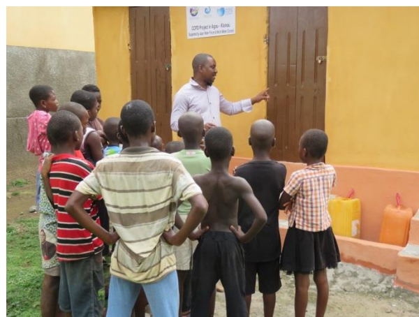
Training for the health promoters