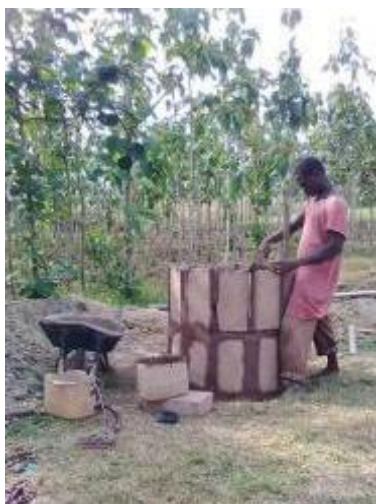
Construction of the well