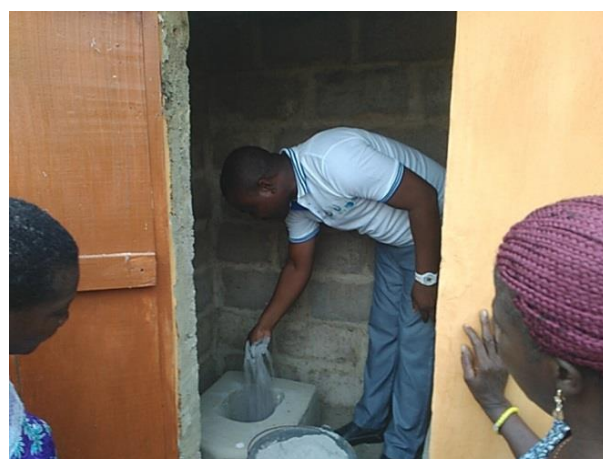
Training of the health promoters