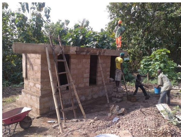
Construction of the Eco-san toilets