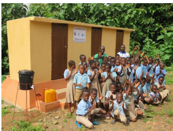
Students with the constructed toilets