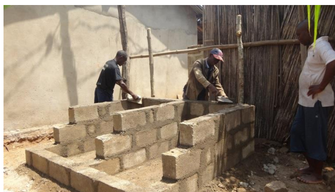
Construction of Eco-san toilets