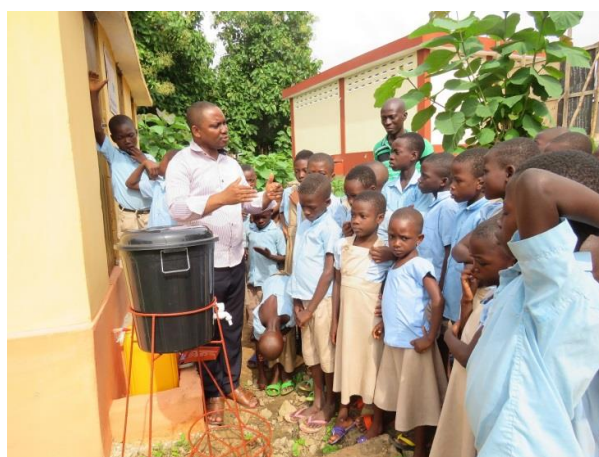
Training for health promoters