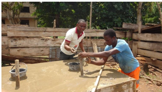
Training to the masons