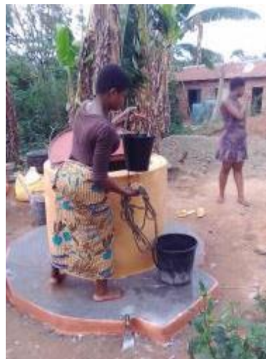
A woman getting water from yhs construted well