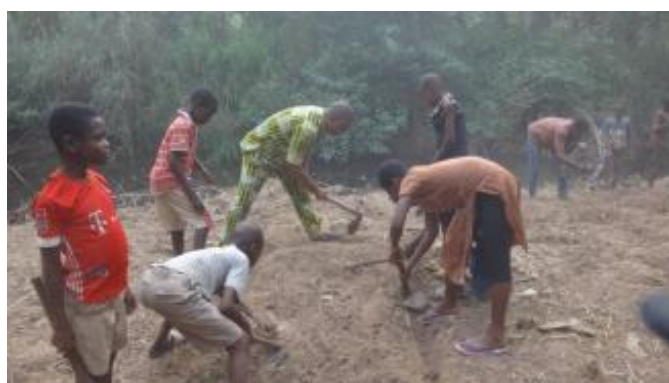
Students in their school garden