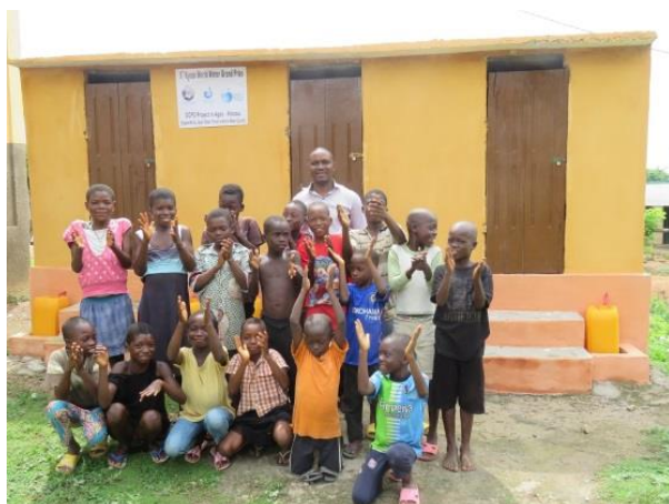
Students with the constructed toilets