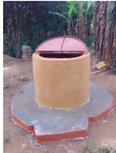
Construction of the well