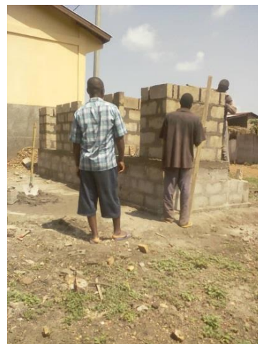
Construction of the Eco-san toilets