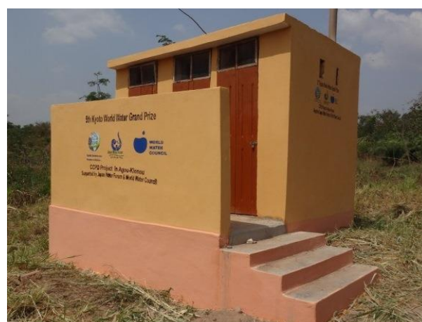
Refurbished VIP latrine