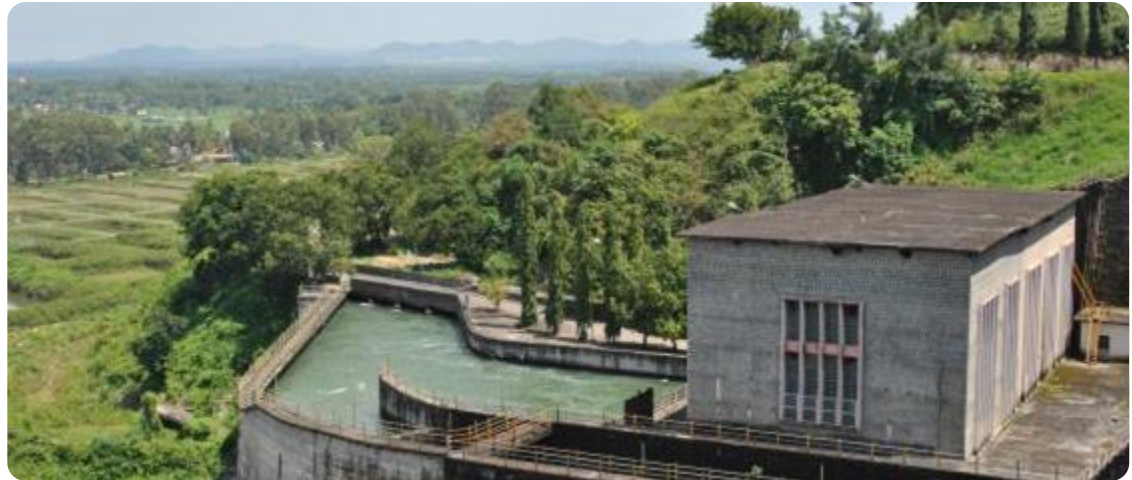
Karnataka Integrated and Sustainable Water Resources Investment Program