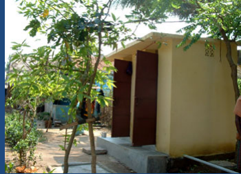
Toilet with Baths