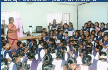
TVS Electronics Ltd. Innovative Concept Vending Machine