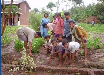
Kitchen Garden Patch