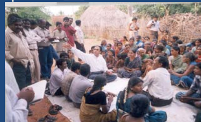
Gandhi Gram Rural Institute