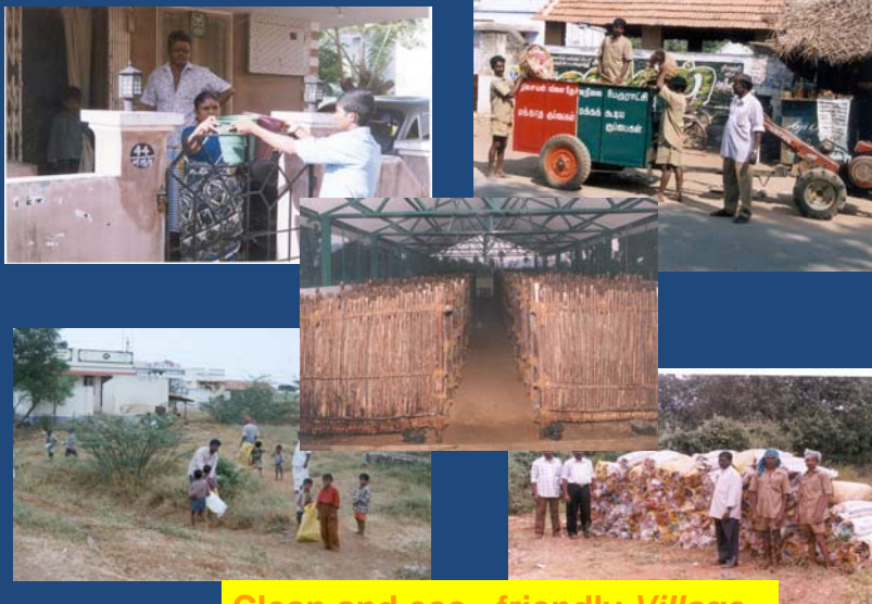
Clean and eco –friendly Village