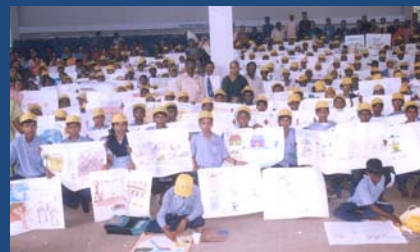
Unicef : Regional level Workshops to support joint planning and linking