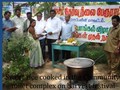
Sweet rice cooked in the Community toilet complex on harvest festival