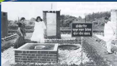
Sanitation Park set up by the Jamnalal Bajaj Foundation (JBF) at Wardha