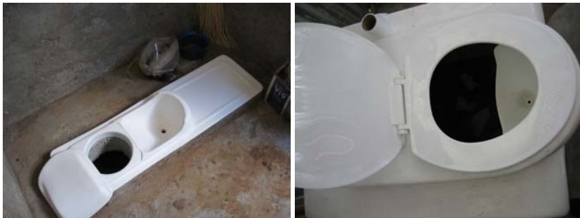
Composting human waste - ECOSAN