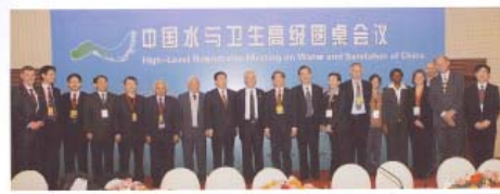
会场合影 Group Photograph of the Meeting