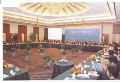
会场全景 Panoramic Photograph of the Meeting Room