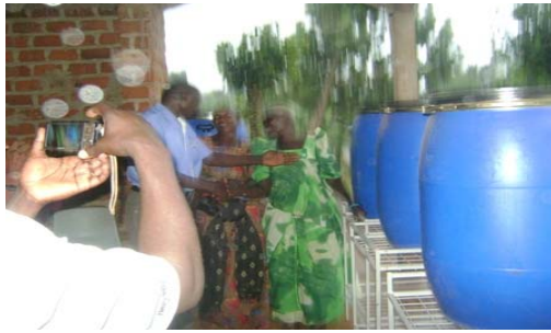
Figure 3 Beneficiaries receiving water drums and stands

C. Site photographs at the completion of your project (at least 1 picture)