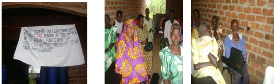
Figure 4 water & sanitation workshop

A. Site photographs of your educational activities (at least 3 pictures)